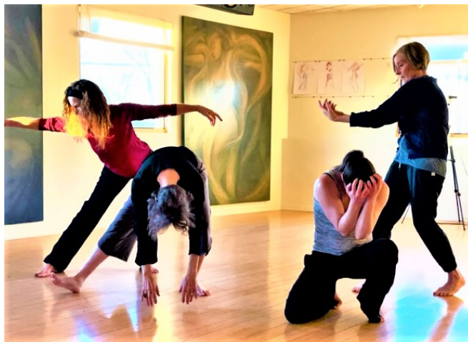
MoveWest Dance Ensemble